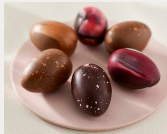
HAND-PAINTED GANACHE EGGS £15.25 • Box of 8 22.5 x 3.5cm • 80g