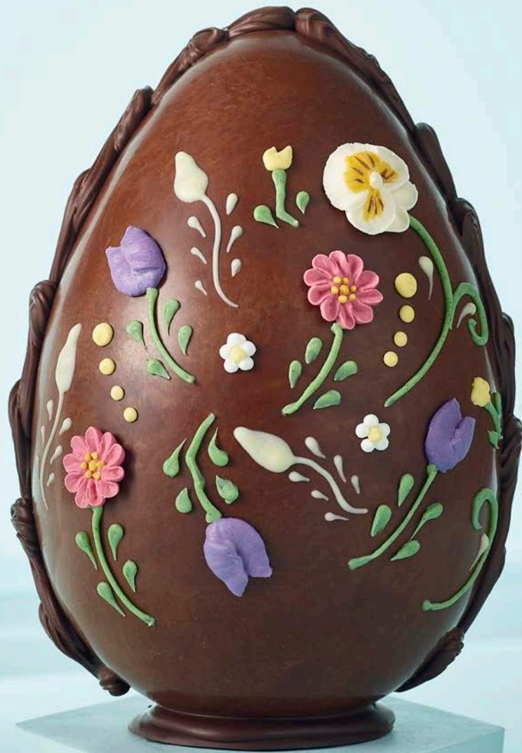
NEW SPRING FLOWERS MILK CHOCOLATE EASTER EGG £42.25 • 19cm high • 350g

Made from our divine Swiss Grand Cru chocolate and exquisitely hand-decorated, our Easter eggs are a truly magical experience.