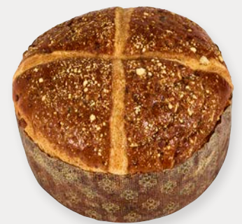
NEW RAREBIT HOT CROSS BUN £8.75 • 15cm diameter • 520g