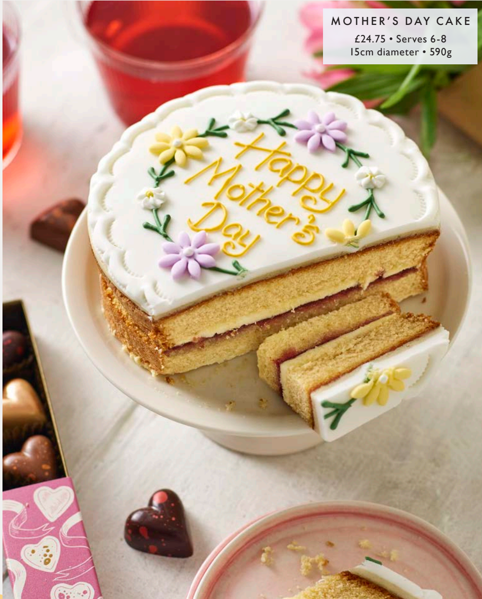
MOTHER'S DAY CAKE £24.75 • Serves 6-8 15cm diameter • 590g

From graceful hand-iced cakes to afternoon tea treats, we have everything for a Mother's Day to cherish.