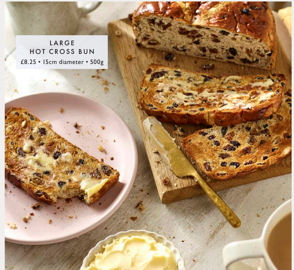
LARGE HOT CROSS BUN £8.25 • 15cm diameter • 500g