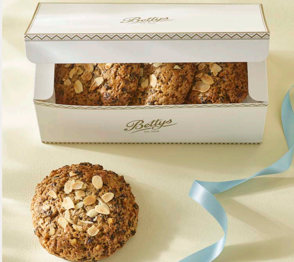
BETTYS BURY SIMNELS £14 • Box of 4 • 24 x 12 x 8.5cm

Tuck in to these scrumptious classics from our Craft Bakery