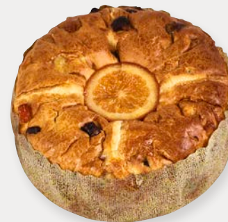
LARGE CHOCOLATE & ORANGE HOT CROSS BUN £9.25 • 15cm diameter • 520g