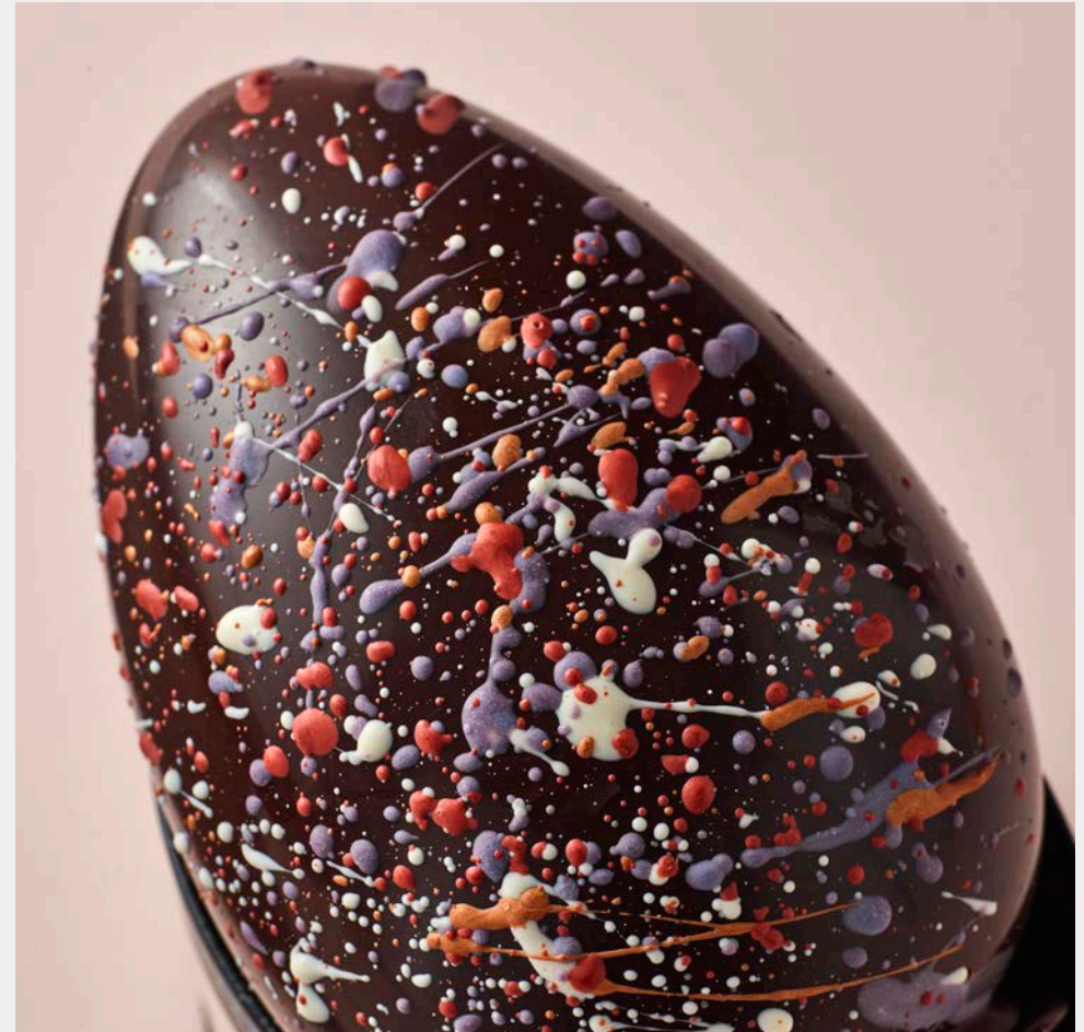
NEW DARK CHOCOLATE SPECKLED EGG £27.50 • 19cm high • 350g