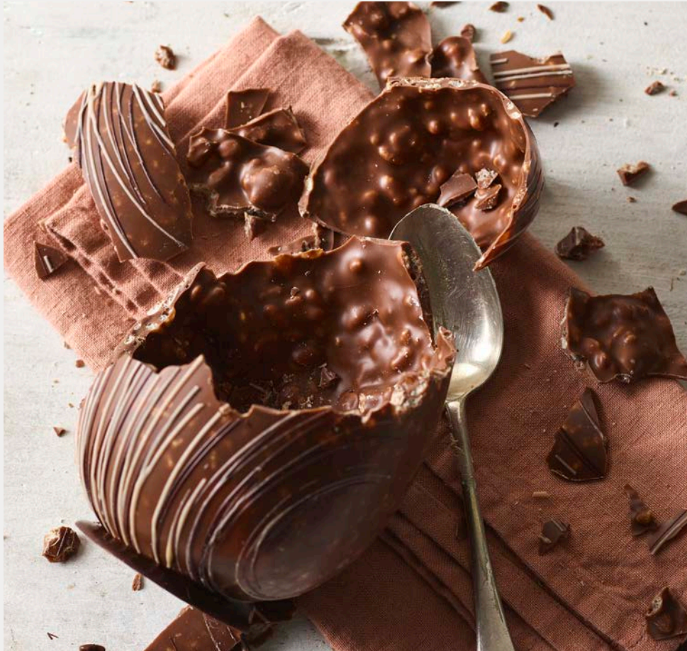
NEW ORANGE CRISP MILK CHOCOLATE EASTER EGG £25 • 16cm high • 190g