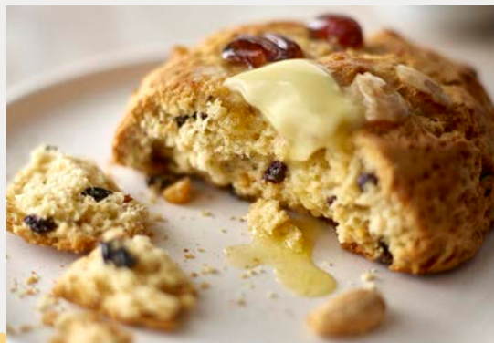
YORKSHIRE FAT RASCAL® SCONES £14 • Box of 4 • 24 x 12 x 8.5cm