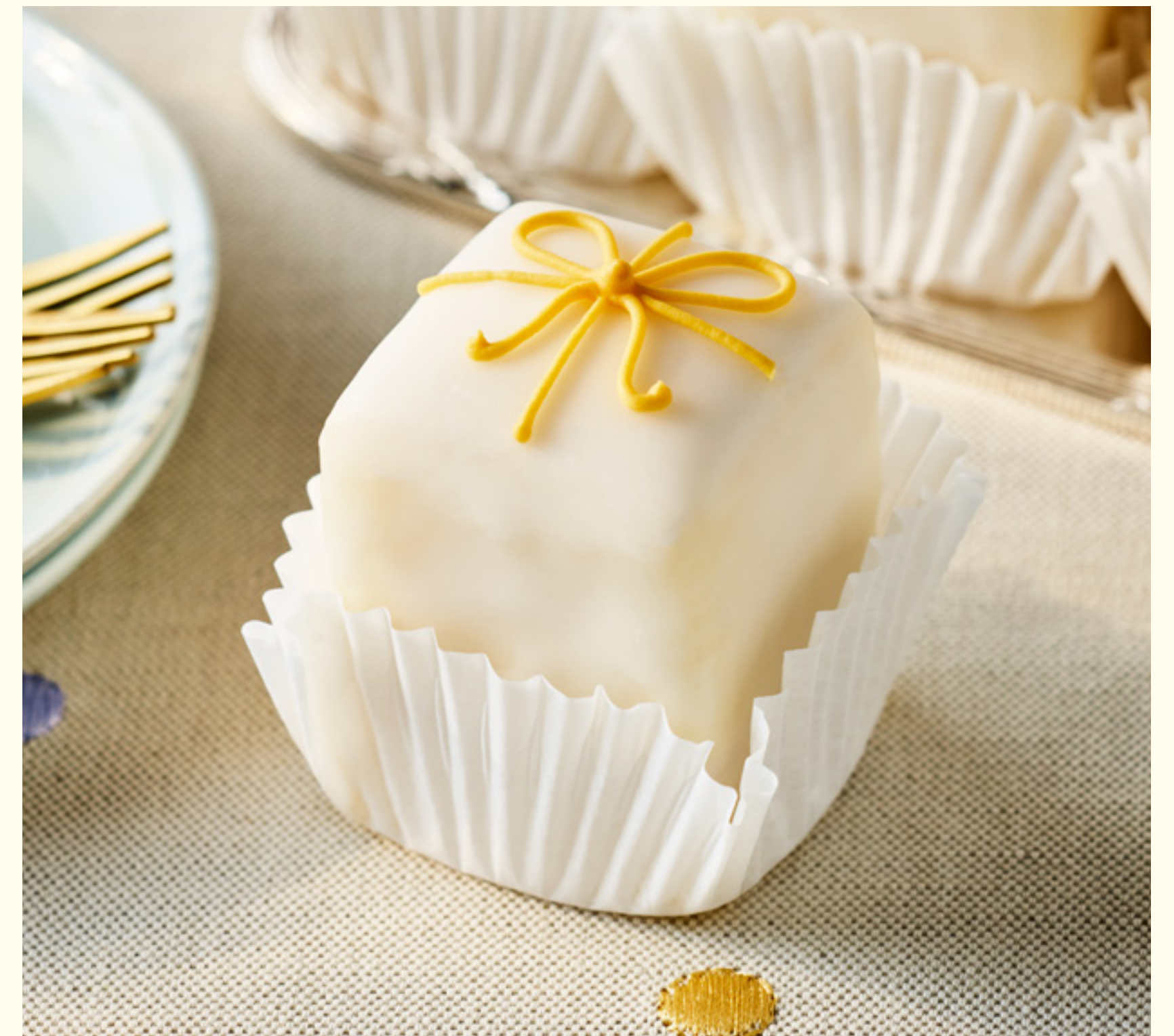
C Parcel £3.50 each