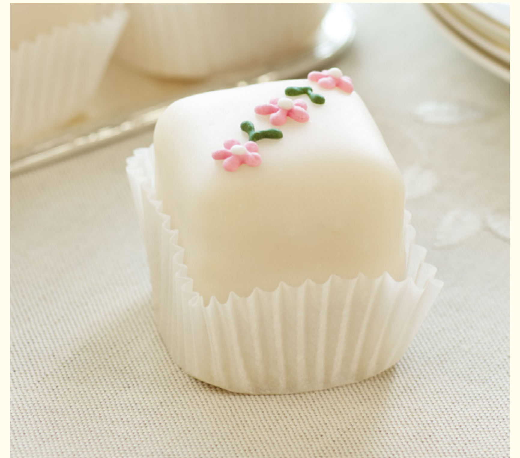
I Three Flowers £3.50 each