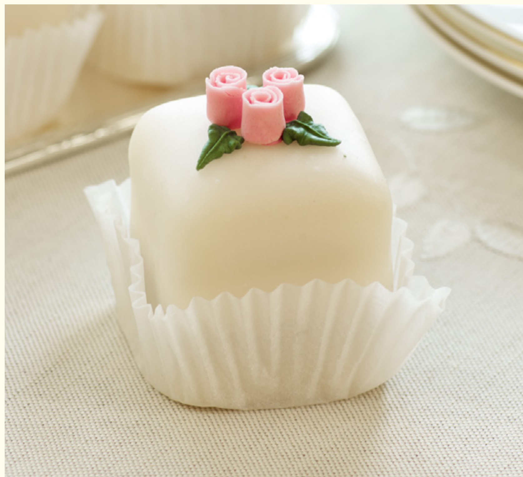
J Three Rosebuds £3.85 each