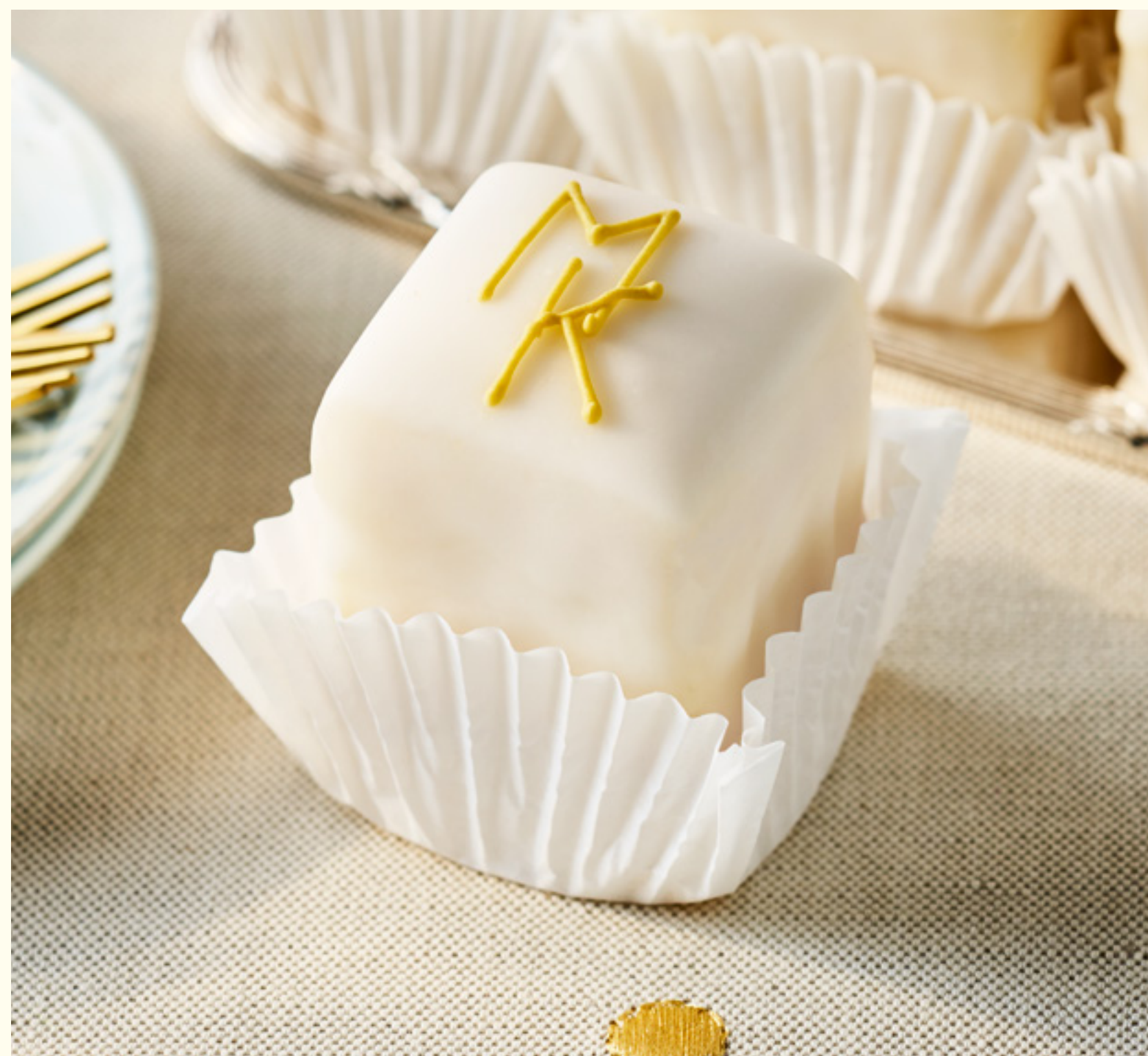
E Monogram £3.50 each