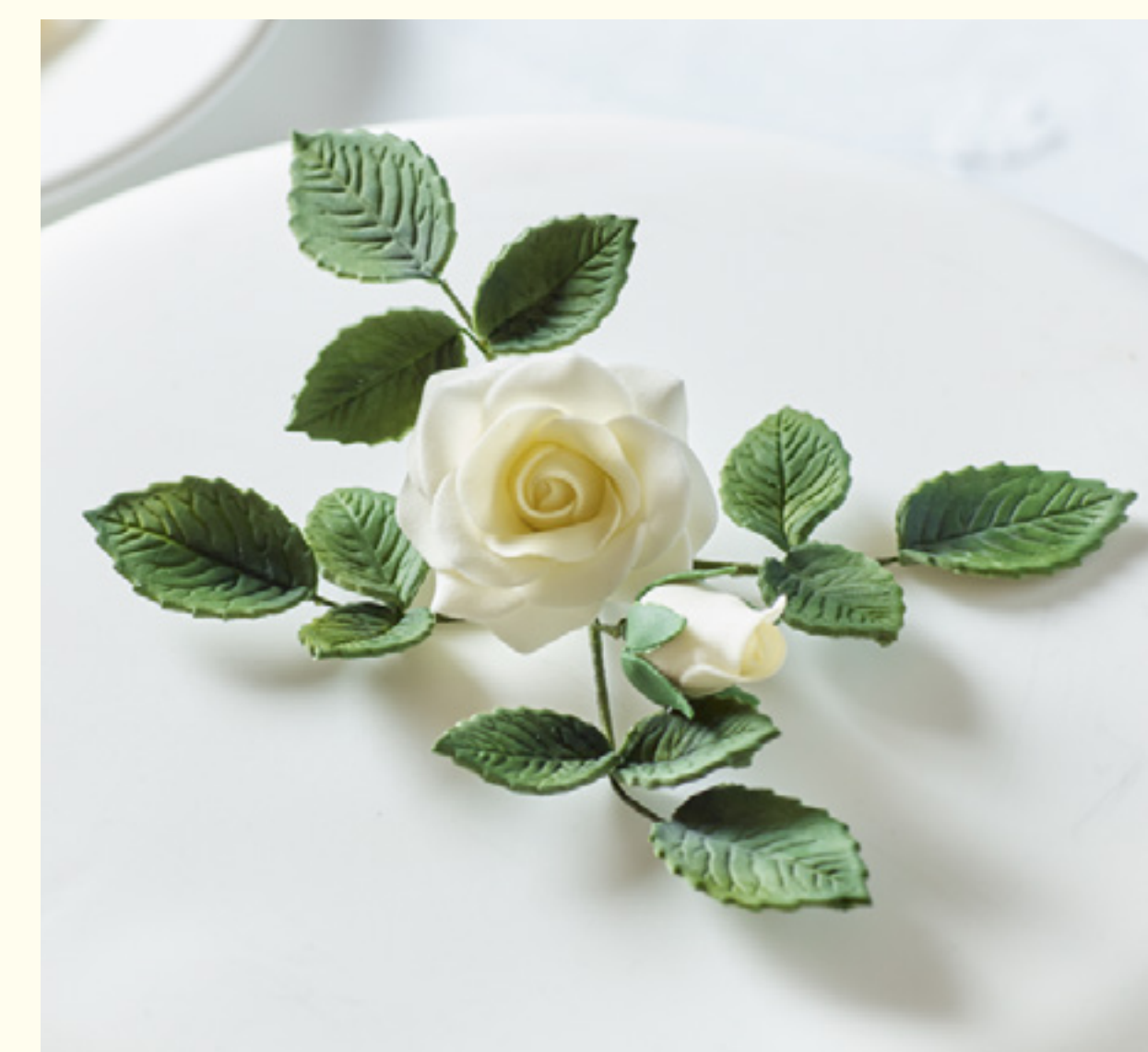
Large Rose Spray