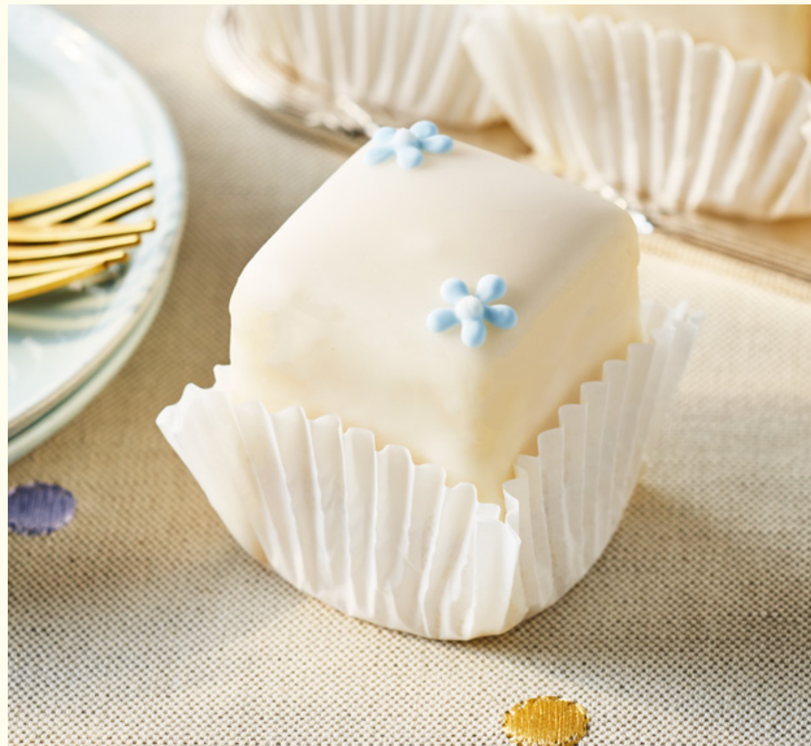
B Classic Flower £3.50 each