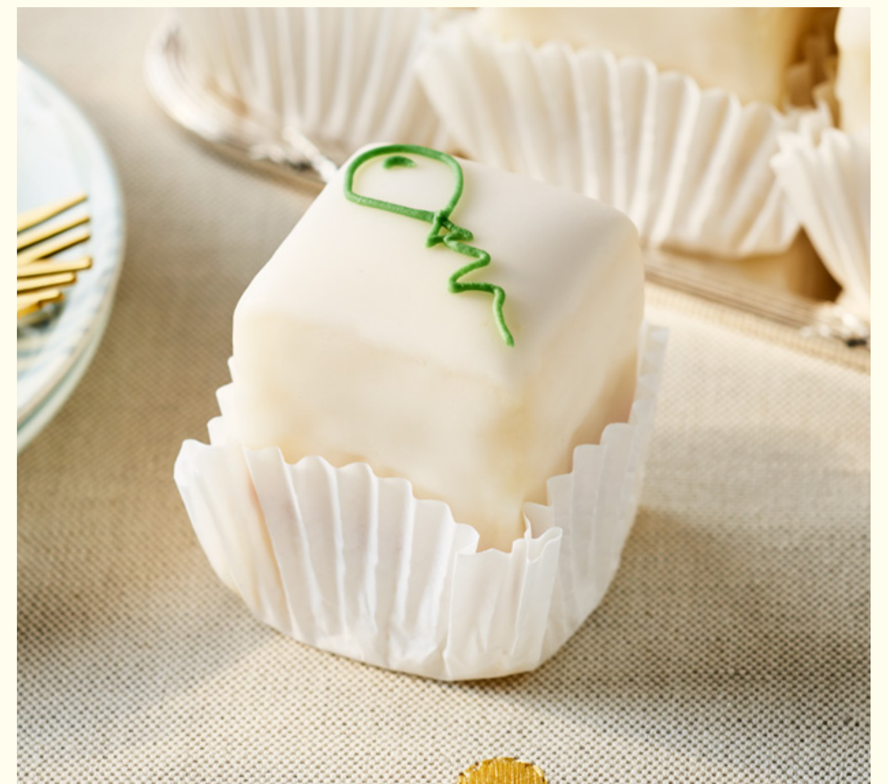
F Balloon £3.50 each