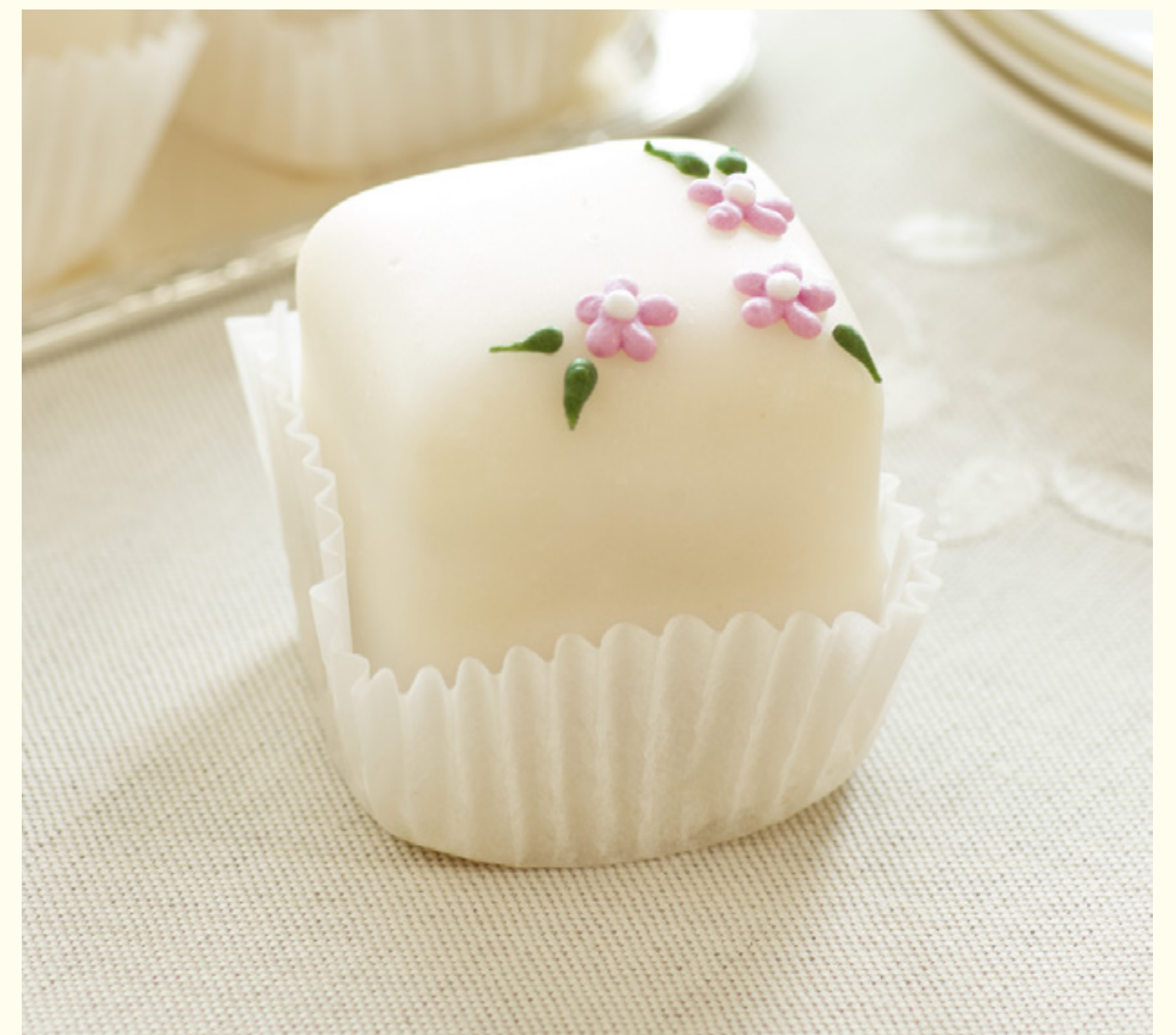
L Three Corner Flowers £3.50 each